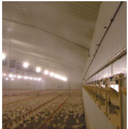
Example of a high pressure misting system

Water can be evaporated from cooling pads or from atomising nozzles. Cooling pads are not common in the UK, and are more suited to dedicated tunnel ventilation systems.