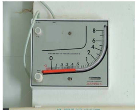
Pressure meters are a very useful tool for assessing ventilation performance.

This depends on the individual specification of the house, house width, and ventilation system. In broiler houses of 18m width and more, with conventional powered ventilation systems, pressures of -30 to -40 Pascal (Pa) should generate the recommended airspeeds.