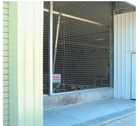
A modern broiler house using combined conventional / tunnel ventilation. Air is drawn through the tunnel inlets shown and drawn at high speed down the length of the house.