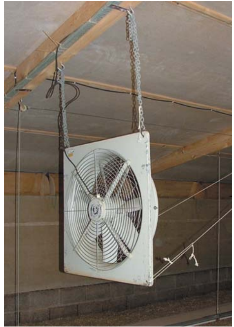
Hanging recirculation fans have a role to play where air distribution is poor.