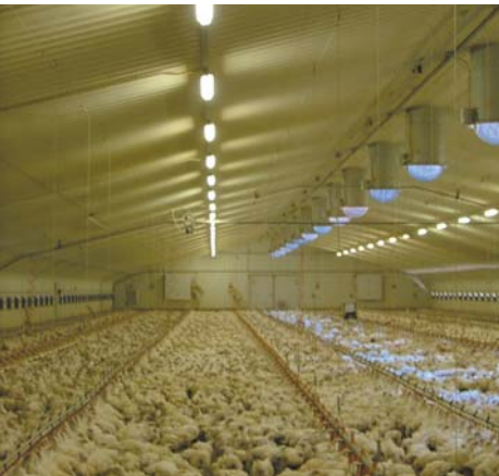
A modern, well insulated, clear-span broiler house. Ridge fans are placed in high-efficiency chimneys. Modular sidewall inlet units can direct air at high speed over the birds.

However, extreme summer temperatures must be considered inevitable and some provision to minimise heat stress in extremes must be incorporated within a temperate climate house design. The house and ventilation system must compliment each other to achieve maximum benefit. The result might be a house designed for combined conventional / tunnel ventilation, or being narrower for improved efficiency of air flow, or incorporating some form of air conditioning.